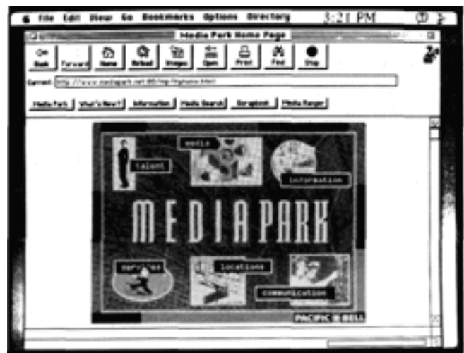
Figure 1 Media Park Home Page

Although each multimedia experiment is unique, there are common threads running through each of them. First, each encourages the participants to experiment with new communications technologies and services. For example, in the Test Track, there is a strong emphasis on research and development of new products for SONET and ATM networks, but the discovery and development of new applications is also important. And, in Media Park, technology development is highly dependent on "mapping" current business processes to ephemeral, network-based "virtual studios" (see Figure 1).